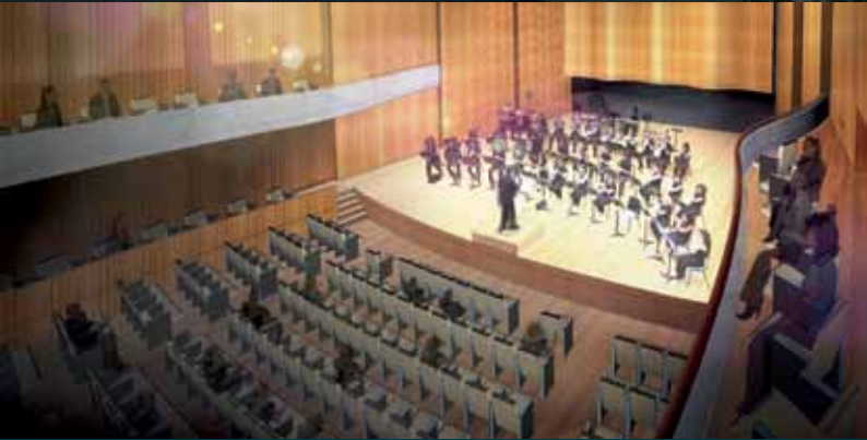
Artist's renderings (design in progress) of the new School of Music facility and Concert Hall.