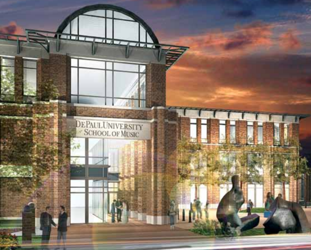
The new School of Music Building (design in progress)